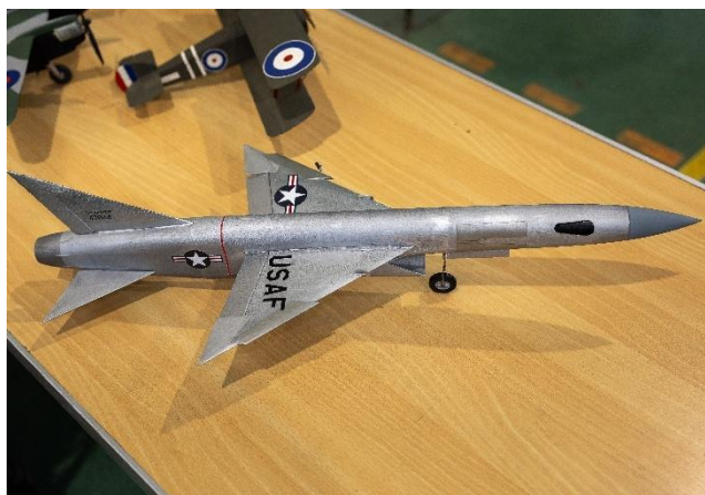
This US prototype hopped and skipped