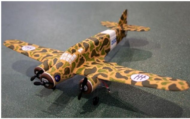
Another of Roys new models a Siai-Marchetti SM.79 Sparviero (Sparrowhawk)