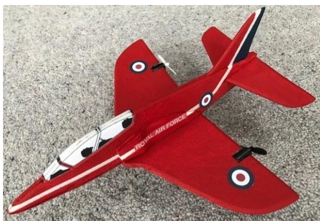
This is Paul Burlings latest indoor RC creation made from the RC gear from a cheap foamie.

Paul reports - I have been experimenting with some ultra micro RC on a budget, under £15.00 over Christmas.