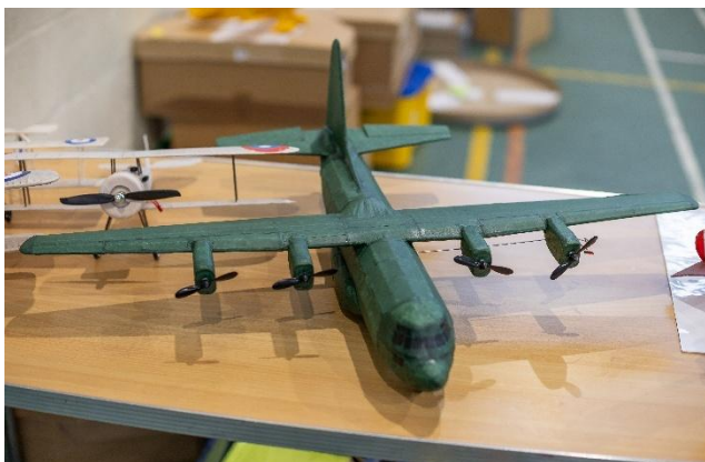
C-130 Hercules with 4 working engines