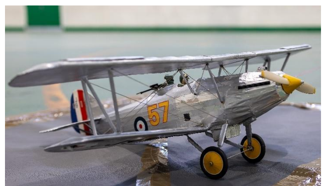
Name that famous plane!