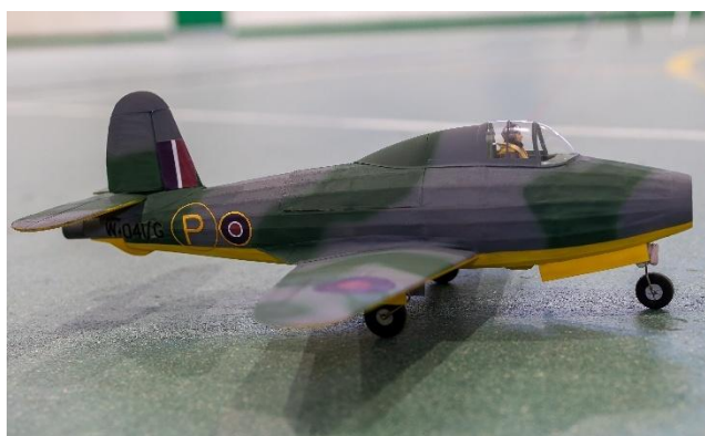
Gloster Whittle – Britains first jet aircraft