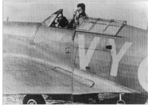
Photos: Group Captain Peter Townsend – 85 Squadron with the actual aircraft

The workshop is normally open on a Tuesday, Thursday and Saturday afternoon. Once restored, the aircraft will be displayed at the Brooklands Museum in Surrey. However, if you can't join us, donations would be gratefully appreciated.