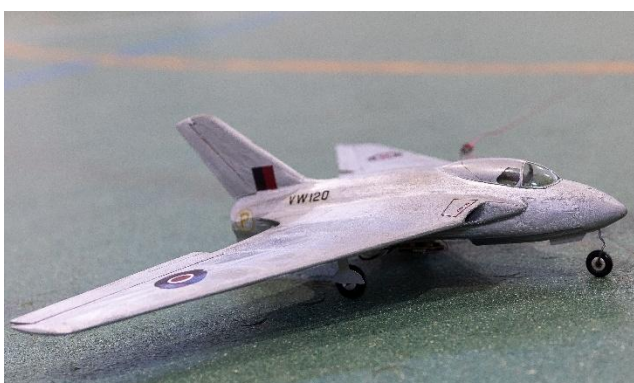
DH Swallow by Will Beavor