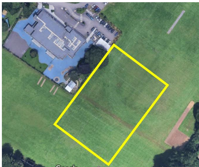
Location of the new sports pitch