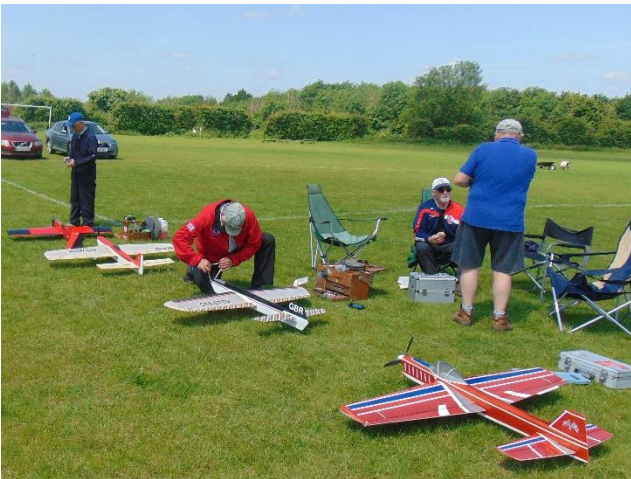
Competitors in the pits