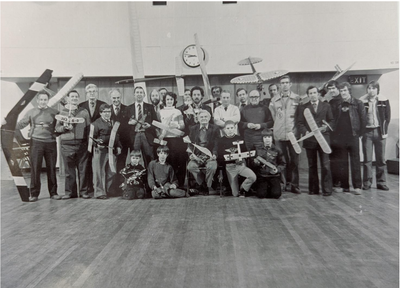
What about this club photo from 1982? Remember flying in the Gropius hall? A sub optimal experience in many respects!!