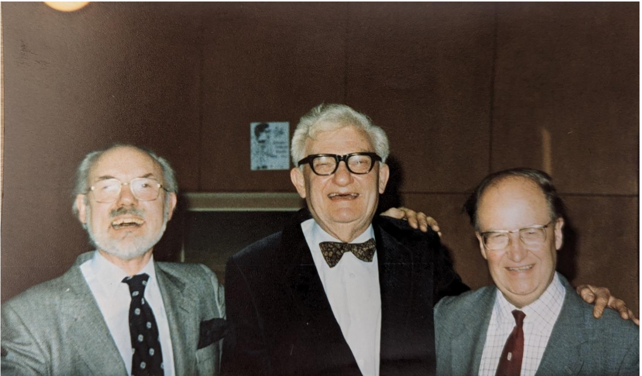
Name this happy trio – date unknown but probably about 1980ish