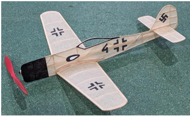
Paul Sheas Nocal FW190 flew really well.