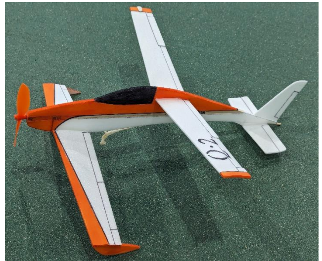
This unusual model is a Quickie 2 built in foam by Paul Shea. It glided really well but needed some downthrust when powered so a bit of surgery is needed before the next flights.