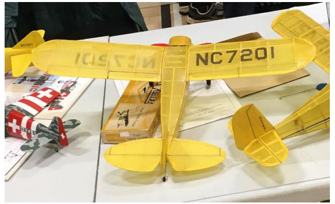
The Piper waits its turn