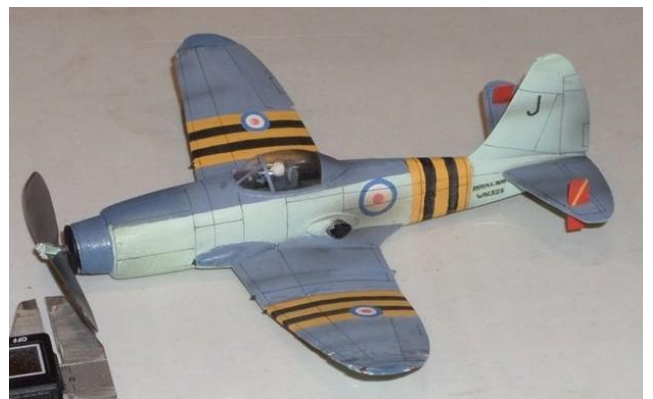
Garry's Pistachio Westland Wyvern