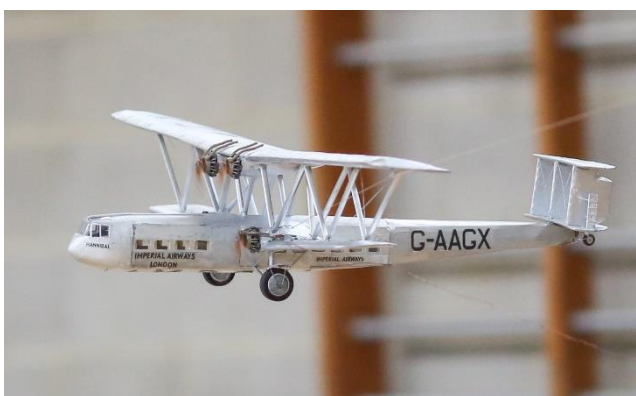
An amazing collection of scale RTP models but can you name them all?