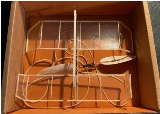
The disassembled model in the box

Well, I enjoyed the challenge and it kept me busy for a few hours.