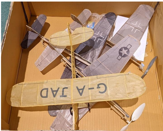
Bruces selection of NoCals