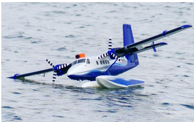
No damage to Malcolms Twin Otter after a float collapsed when landing at Northstowe