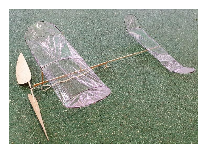
Bruces lightweight model with balsa fuselage and prop plus carbon fibre wing structure.