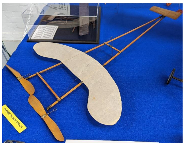
1910 original contest winning rubber model seen at the BMFA Buckminster 100 years of model flying exhibition.

This A-frame pusher weighing 4oz was built by Richard (later Sir Richard) Fairey and won a contest on Wimbledon Common in 1910 with a flight of 153 yards also winning the steering and stability gold medals. Power was eight strands of 1/8 inch rubber. The fuselage was made of spruce with joints reinforced, bound and glued and a wire king post and thin bracing wires to resist the tension of the rubber motors.