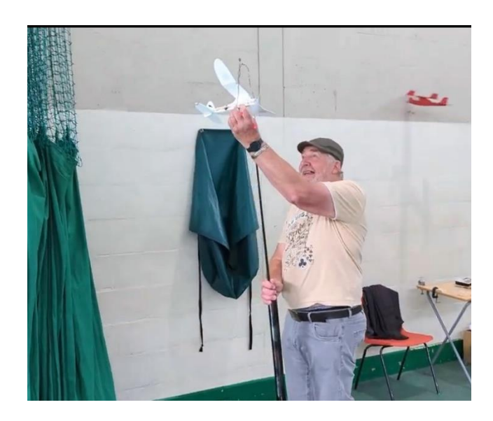
Naturally Bruces pole was put to regular use. We'll need a bigger pole for Duxford LOL