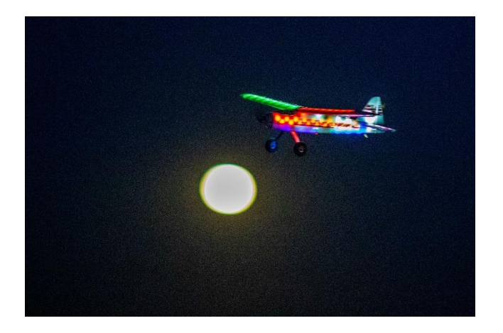
Flybeam pictured passing the Sturgeon moon in August.