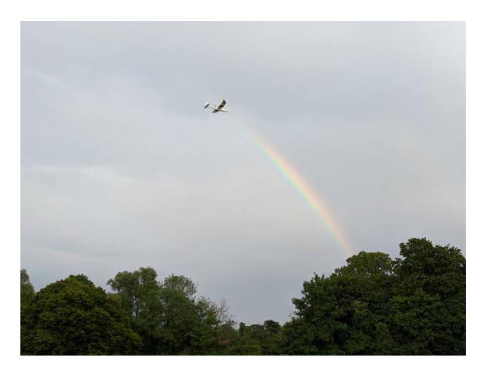
Easy Star at Impington last summer – remember that? Sadly no pot of gold was discovered!!