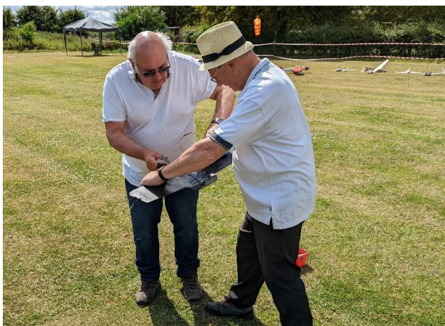
Start you b*****! The 2 Davids get a combat wing ready for flight. Oooh – the smell of diesel.....