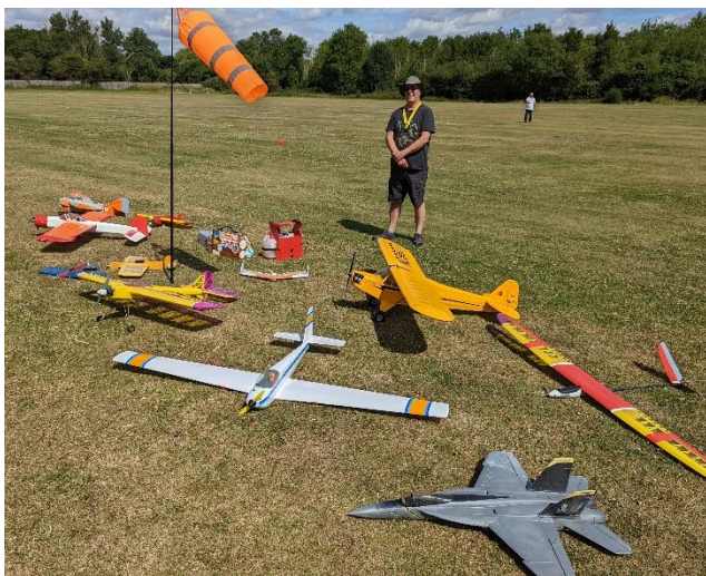
Gary's impressive line up of CL and RC models. The i/c powered Cub flew most of the day and made an impressive sight in Gary's hands.