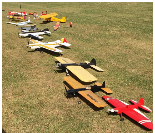
More CL models lined up