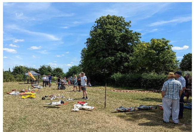
We did have a decent crowd on and off during the afternoon and have had several enquiries about joining the club.