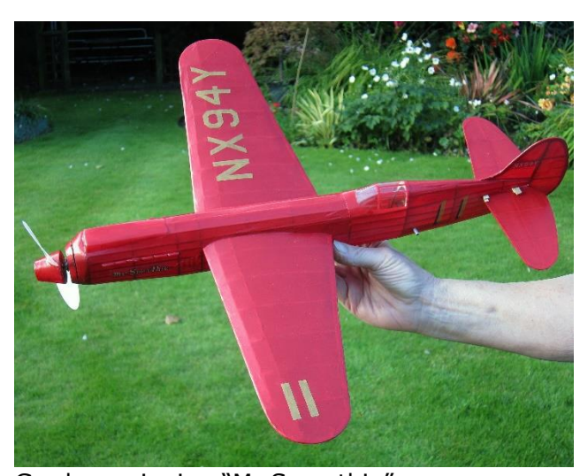
Gordons winning "Mr Smoothie"

This is quite a prestigious trophy competed for under the auspices of the Society of Antique Modellers (SAM) - in recent years at Old Warden. Entry is for any scale model and is on duration performance. Bonuses are given in the form of percentage additions and are on such things as wingspan (less is more!) number of wings, low or high wing etc.