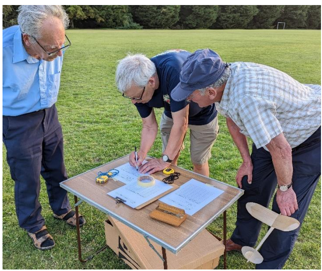
The judges manipulated the results!!