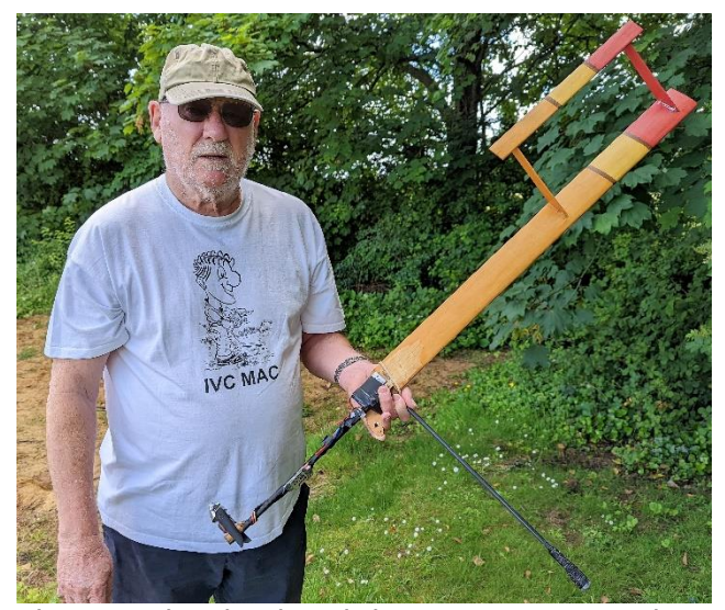
This is Richards Charybdis – a very unusual model. This one is electric powered built about 10 years ago. Throttle control only.