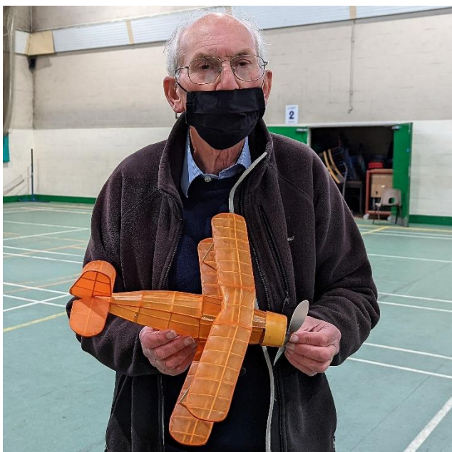
This one is his Bucker Bü 133 Jungmeister which was a 1930s German trainer. A difficult subject with little dihedral.