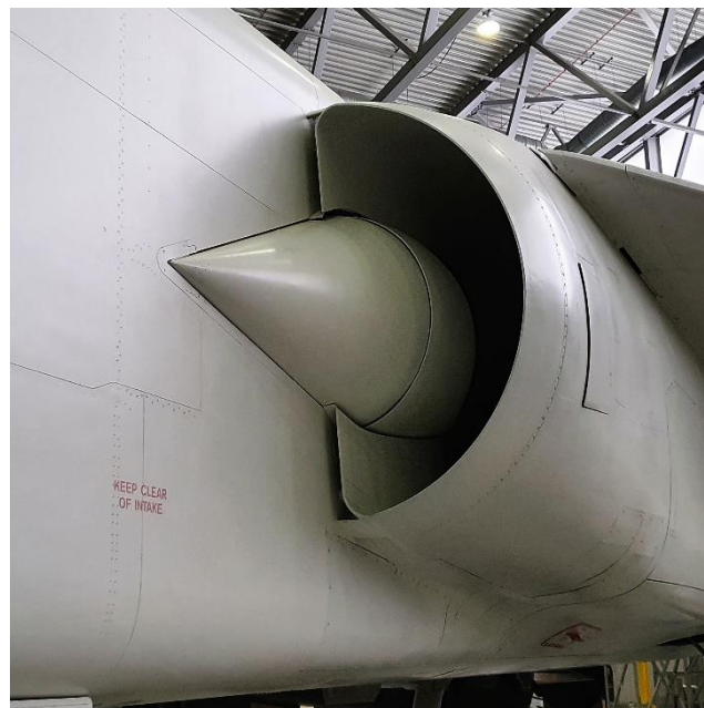
Another relatively easy intake for you to guess the plane. Seen at IWM Duxford.