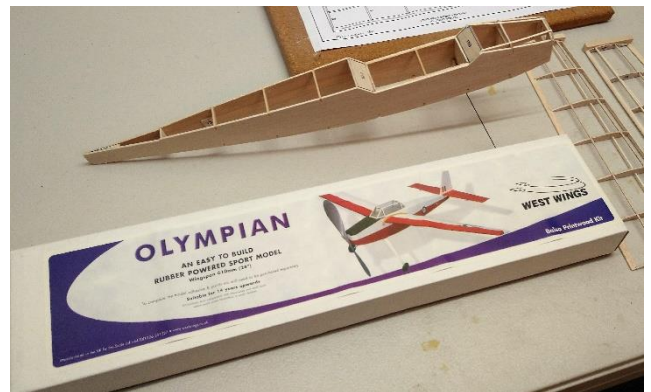
The cute box probably caught him with his guard down. The fact is that there is more building in this tiny box than most RC planes.

Not a current free flight modeller, this is being built by Trevor Sexton after a layoff of about 45 years!! Trevor is more normally seen flying DJI equipped FPV Quads.