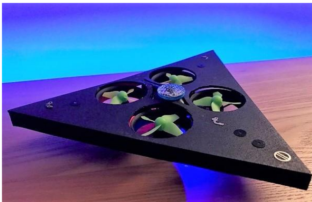
And his TR3 Black Manta