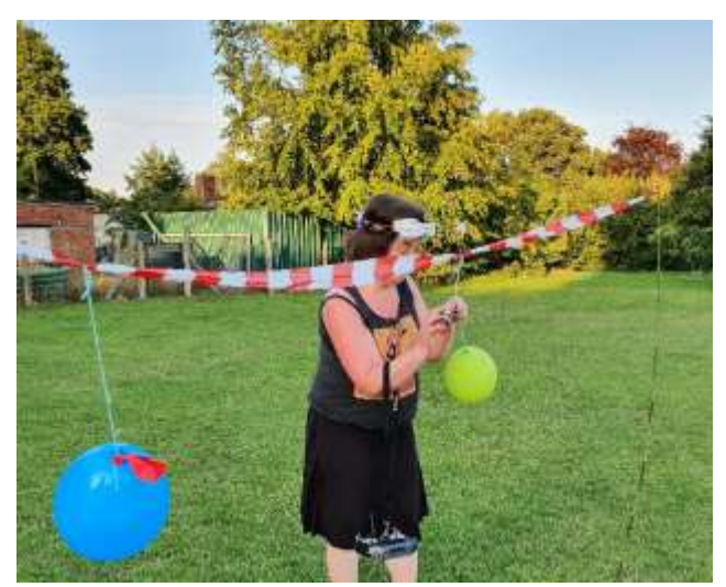
The Quad flyers tucked themselves away in a quiet corner and indulged in frivolous pursuits