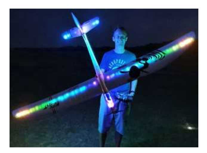
Neils Night Radian