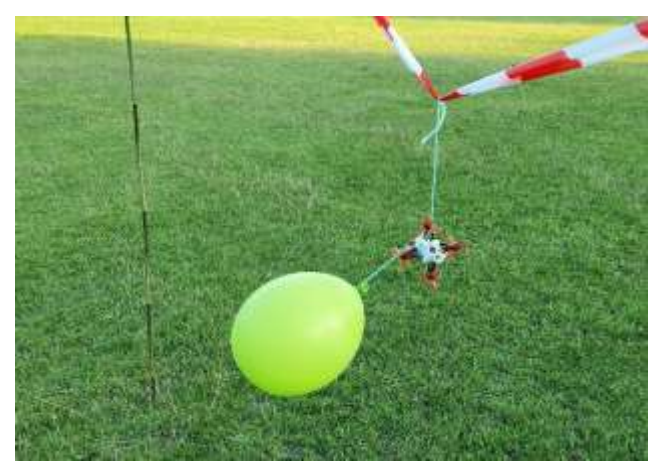
Various Quads got caught in the balloon bursting competition