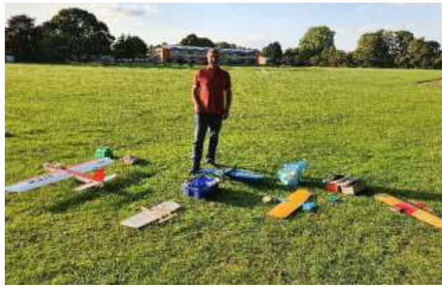
A nice line up of Control line models in the naughty corner