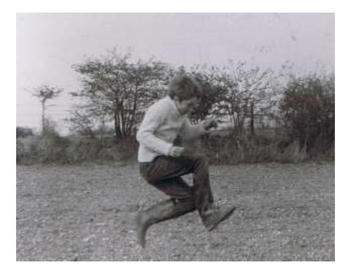
Who is this young chap skipping though a field in 1973? Answer at the end.