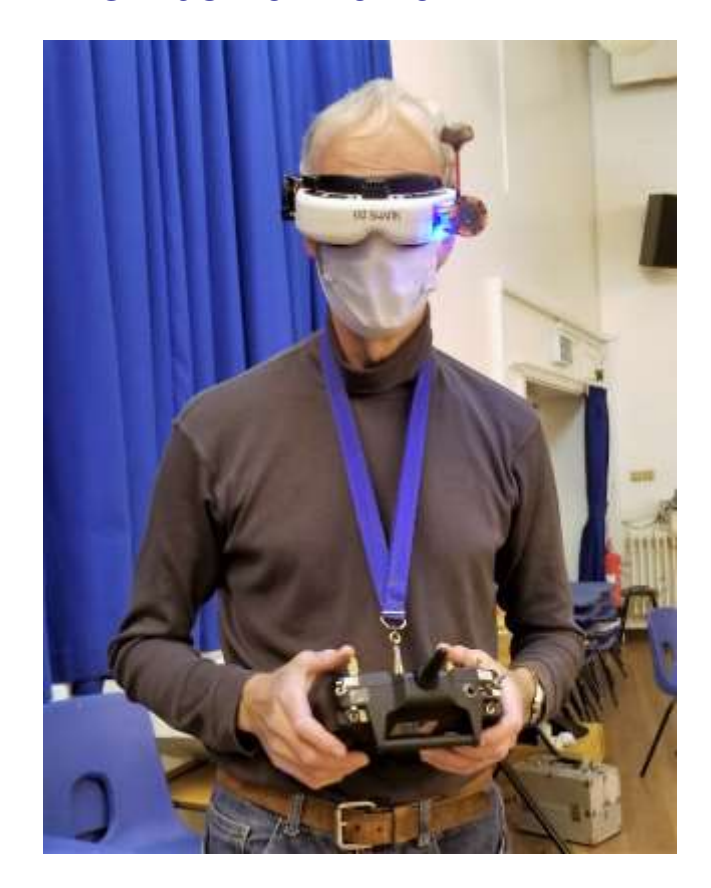
Let's hope that this isn't the future of indoor flying.

The PPE is probably pretty effective, but it cuts the conversation down a bit!