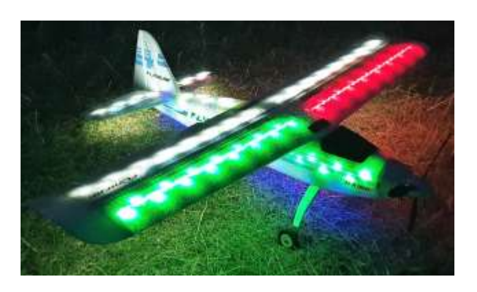
Alans venerable Flybeam (looks better than it flies!!)