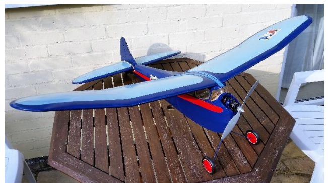
Here is the Spectre brought into the 21 st Century and ready to fly with an electric powerplant and Radio Control.