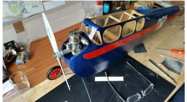
The picture shows the model in the workshop prior to electrification and in its original finery from when it was built 32 years ago.