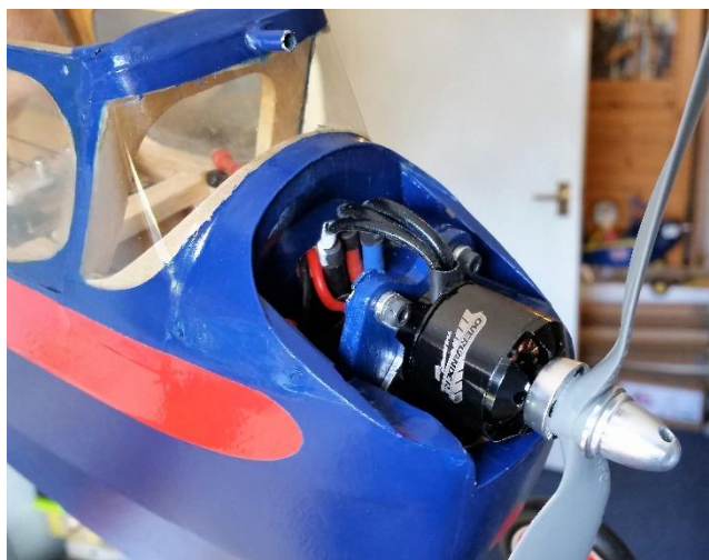
The Overlander motor in the Spectre