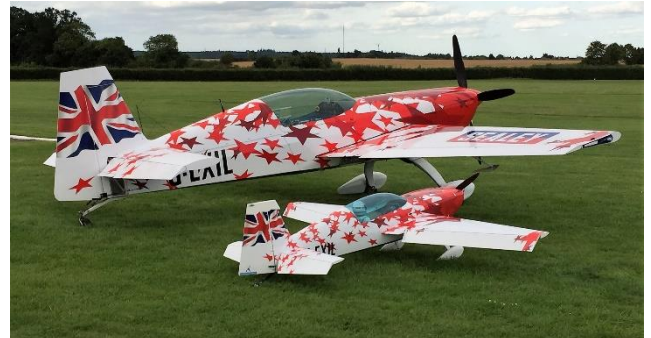
Little and Large Extras parked side by side

Trevor and I were commenting during the display that the full size pilot was actually flying formation with the model, which when you think about it makes sense as doing it the other way round would be even more difficult!