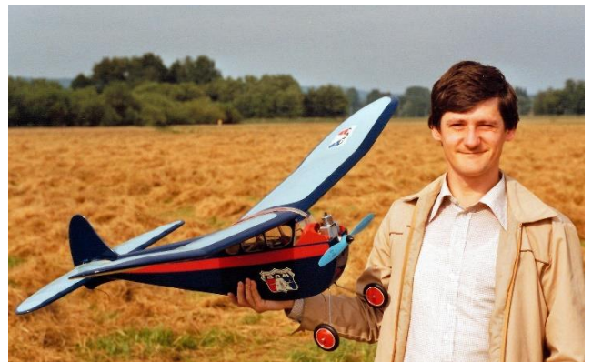
Gotthelf with the diesel powered original in 1985. He hasn't changed much has he?