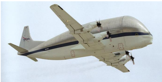
NASA's Super Guppy – but can you come up with a better caption?