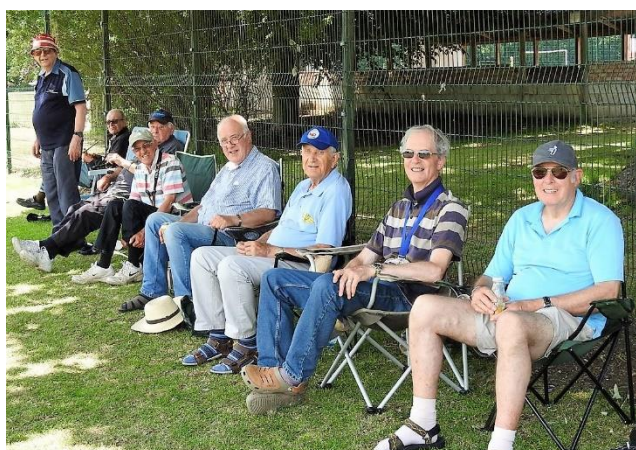
A mixed bag of spectators taking it easy out of the sun which was scorching at times