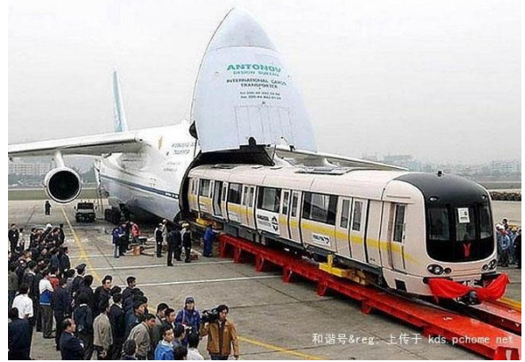
This was last month's competition and the winner was anonymous with "South West Trains employ a novel method to stick to their timetables".