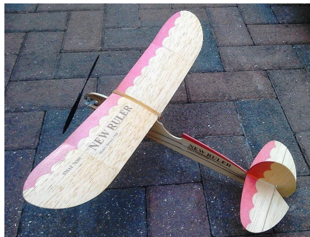
Alans winning model - a much reduced homebrewed profile version of Henry Strucks 1940 New Ruler, the original being 6ft span and free flight with a sparkie up front

A fun evening and one to be repeated as any flyer with any model can have a go.