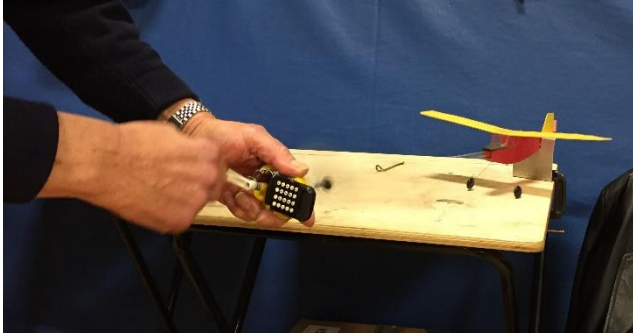
Another illustrious modeller and long time club member who also like catapulting gliders outside in the summer