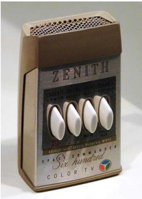
Answer at the end of the newsletter.....