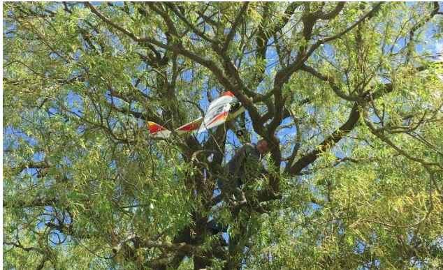
Stage 1 – modeller climbs 20 feet up in tree and is “almost there”. Surely a quick shake will release it? Well not quite!

The following photos show the recovery of an undamaged Wot4, however, this method is not recommended for the faint-hearted!!