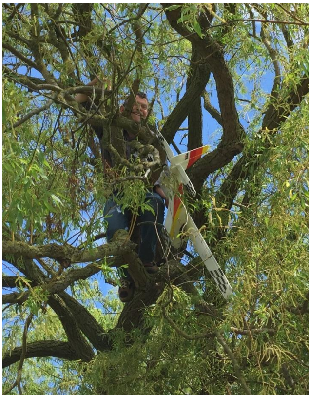
Stage 2 – Modeller reaches model, untangles it and drops to waiting photographer.