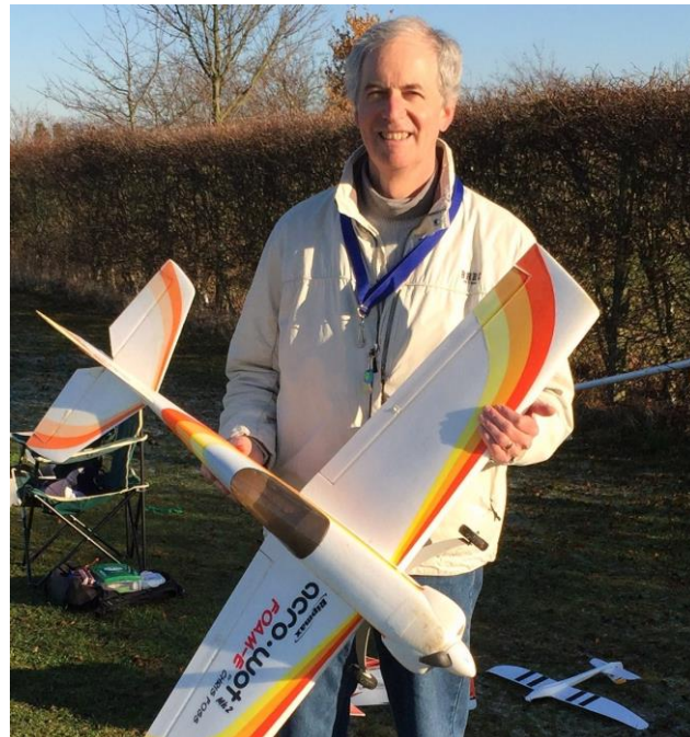
My Acro Wot – lovely slow flyer, but shove the throttle forward and it goes like the proverbial off a shovel.... This is an ideal first low winger for anyone. Chris Foss certainly came up with some excellent designs that have stood the test of time.