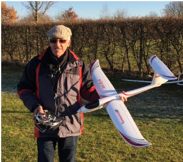
Tony Neals fast flying Diamond 1100 which flew well after a recent "nose job" repair!! Not for beginners this one as you need to keep the speed up at all times to avoid it flicking in.....