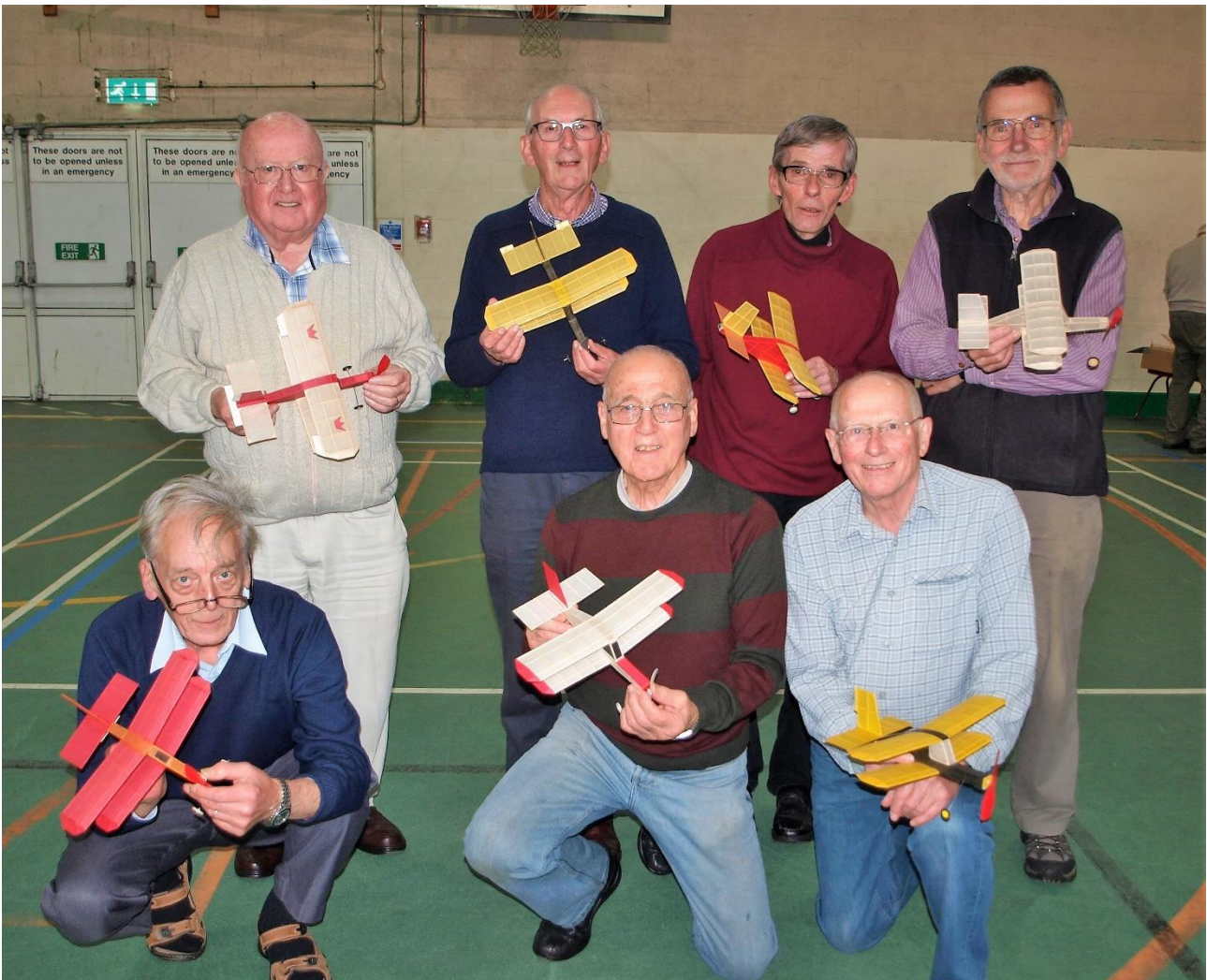
An impressive line up of experienced modellers in the Sports Hall on 19 th October with their Wrens