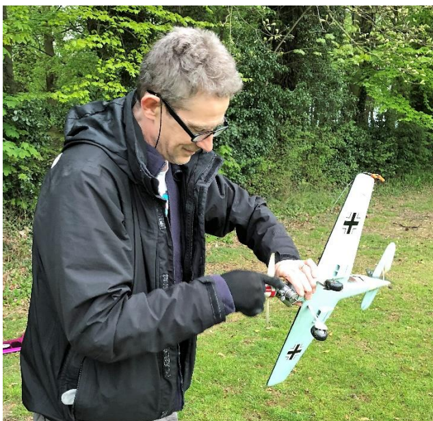
Nice ME109 – come on, start you little blighter!!