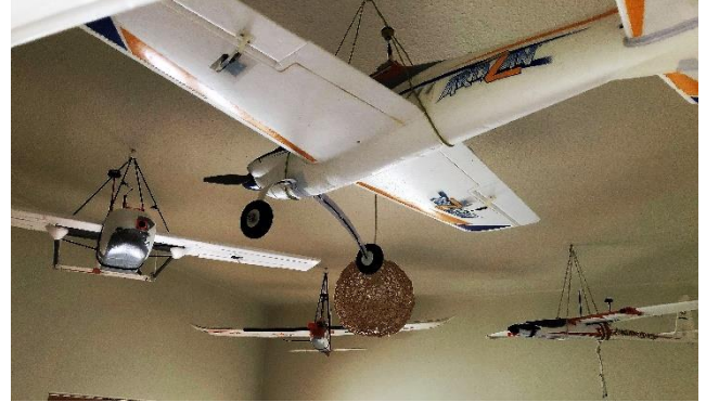
Alans indoor FPV Hangar

Prompted by the amazing photo of Richards very small and tidy aircraft storage facility and Clives amazing shelves full of rubber models, I decided that mine was somewhat random and spread out!!