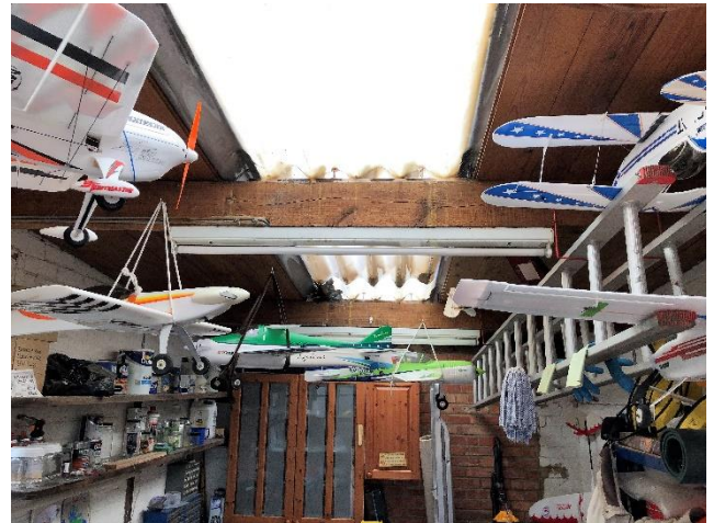
Alans outdoor Hangar for "the rest" of the fleet.

Bring out the photos of your tidy (or untidy) hangars!!