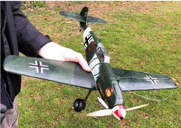
A close up of Daves ME109