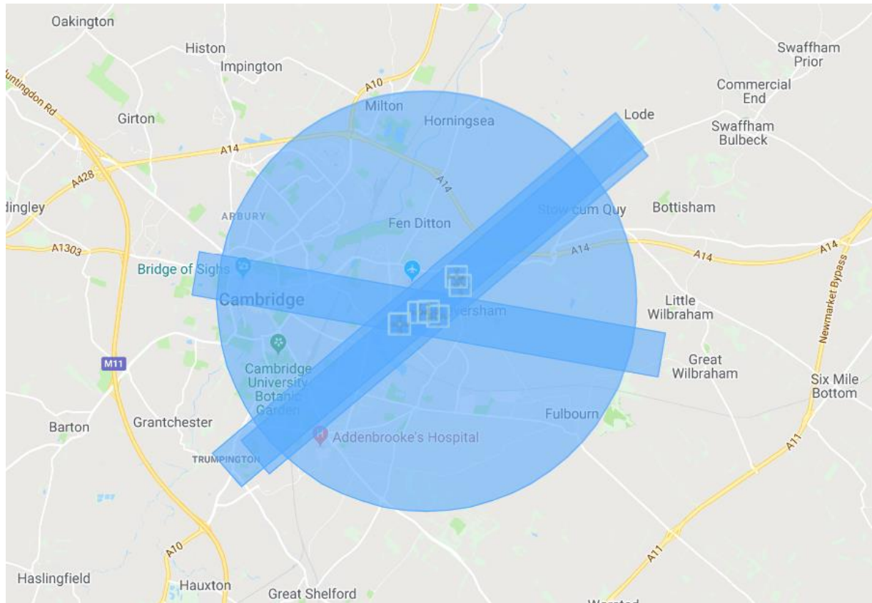
The Cambridge Air Traffic Zone