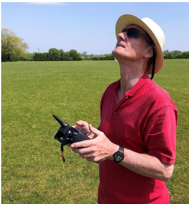
The Sharkface flew beautifully with bags of power and he soon had a smile on his face!!