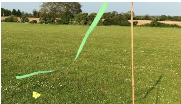
A small yellow butterfly got rather attached to our windsock, and in the end I had to take it down before the butterfly wore itself out. It then landed on the plastic and decided it looked better than it actually tasted.