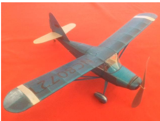
Garry also placed 15 th in kit scale with this Stinson Station Wagon