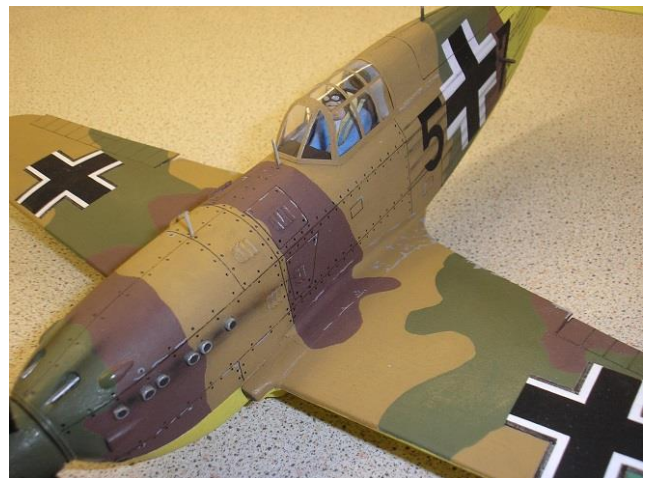
A close up of the detail in Johns model