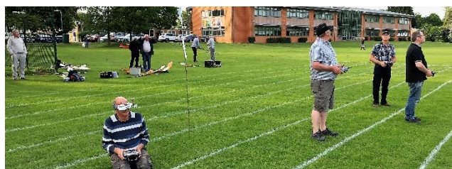
A crowd gathers to fly RC. Trevor kneels in prayer whilst the 3 monkeys look away