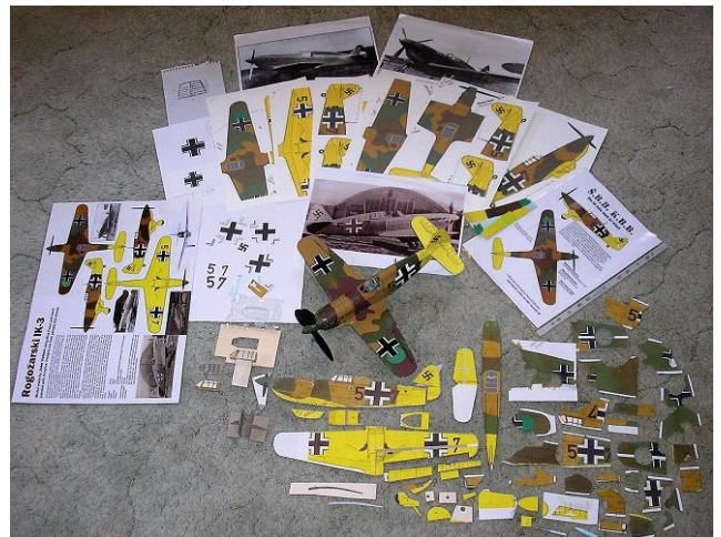
Some of the documentation used for the scale judging plus the templates John used for making and painting the Rogozarski