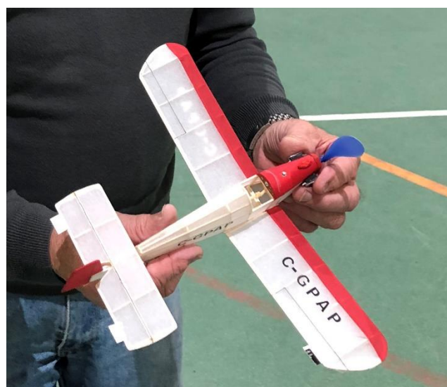
Clives Draine Turbulent