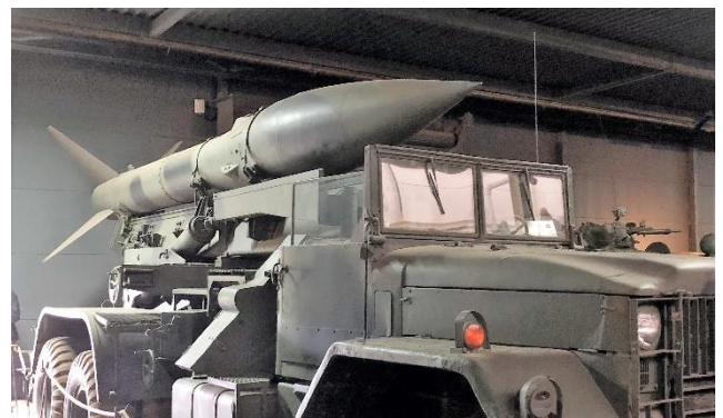
Answer at the end of the newsletter.....