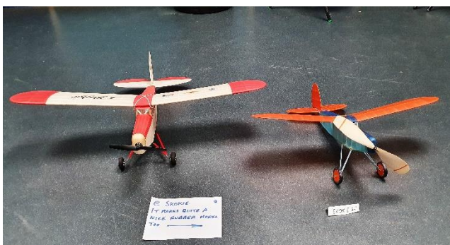
Alan Hunters e-Skokie and the original rubber model