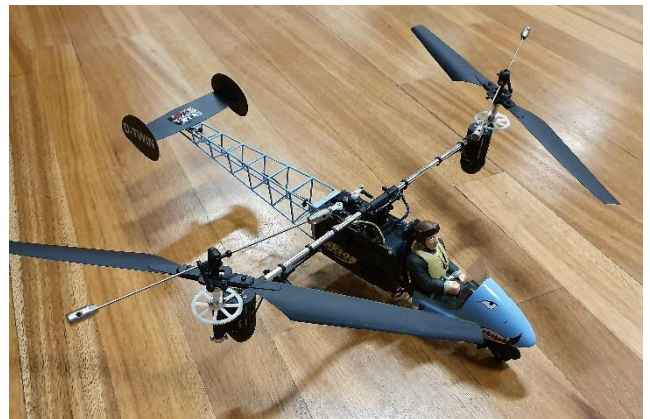
A close up of Oscars heli