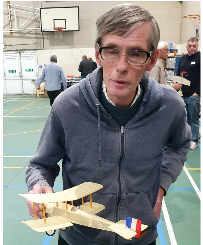
Hughes marvellous Bristol Scout which flew beautifully and slowly to win the Peanut comp