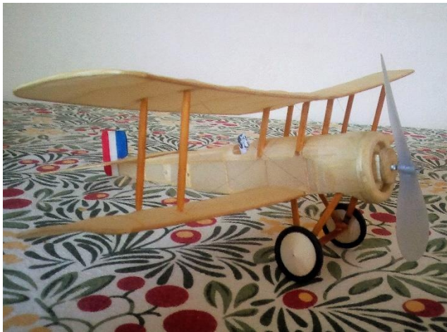
A close up of Hughs winning Bristol Scout