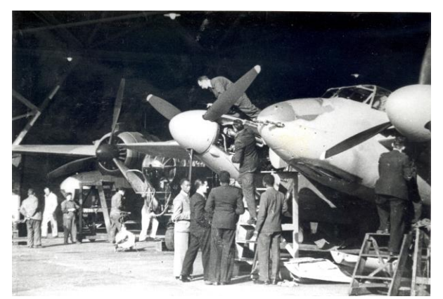
Can you name the aircraft in the background of this 1943 photo?

If there is more demand to look round, we can arrange another visit next summer.