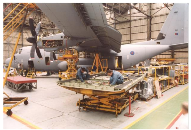
RAF C130J servicing today

30 of us went round Marshalls Hangars on Saturday 19<sup>th</sup> November. I was very pleased to talk to such an enthusiastic bunch about the company history and show everyone around. There has been quite a change over the years as the 2 pictures below show.